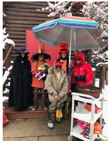
Halloween trick or treating in the snow!