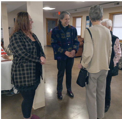
Bishop Katherine Jefferts Schori visiting St. Andrew's